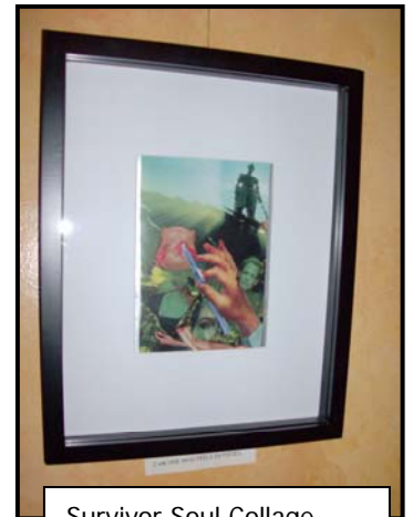
Survivor Soul Collage artwork displayed at the NSRCC Organic Garden

Guiding Force: The North Shore Rape Crisis Center views sexual assault as an act of violence, power and control. We operate based on a strength-based "empowerment model", recognizing that survivors of sexual assault need options and assistance to make the best choices possible based on their life's circumstances.